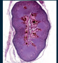
Virtual coronal (left) and sagittal (right) MPR (multiplanar reformatting) visualizations perpendicular to the slice stack after 3D reconstruction.